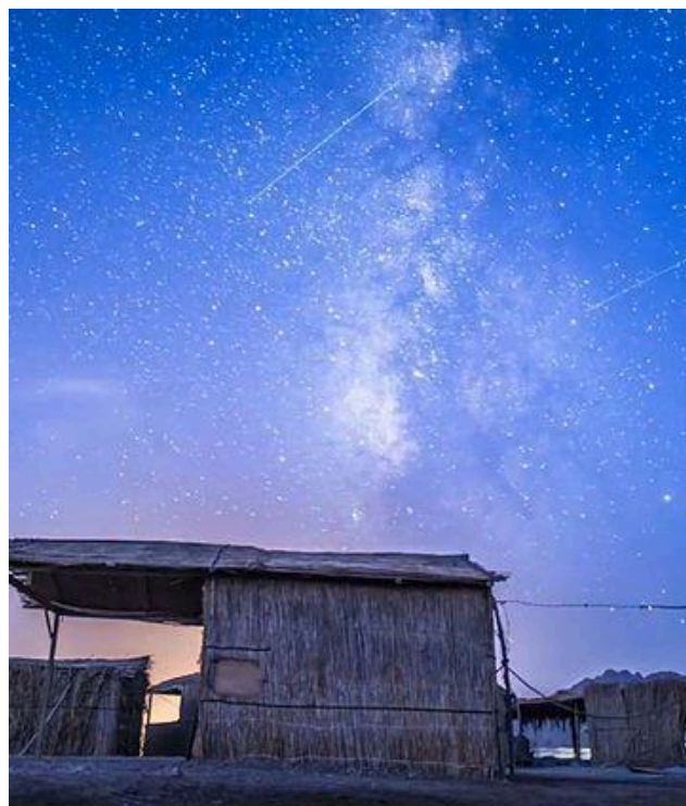
Some of the many sights of Sinai